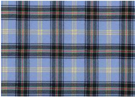
Bell of the Borders