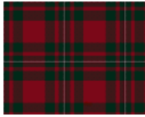
MacGregor of Carney (aka Hunting)